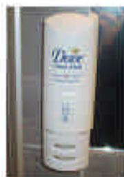
Refillable soap and shampoo dispensers