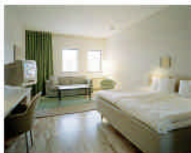
97% recyclable room at Scandic