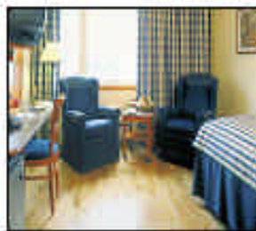
Eco-room at Scandic